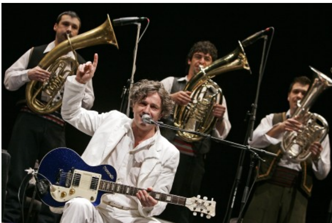
Goran Bregovic performs with his Wedding and Funeral Band in Zurich, Switzerland in 2006.

Goran Bregovic is one of the biggest names in Balkan music, but his appeal stretches well beyond the region. His everything-but-the-kitchen-sink style is perhaps best represented when he leads his 40 strong ensemble known as the "Wedding and Funeral Band." In this BBC segment, he talks about his family's influence on the music on his new CD, "Alkohol." We also take