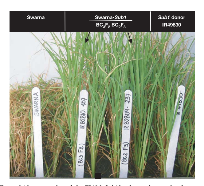
Figure 3 | Introgression of the FR13A Sub1 haplotype into an intolerant variety by MAS confers submergence tolerance. The Sub1 region donor line IR49830 (an FR13A derivative) was introduced into the submergence-intolerant indica variety Swarna by backcrossing (BC) with MAS using markers for the Sub1 region (SSR1, RM316, RM464, RM464A, RM219 and RM524) and the 12 chromosomes ^{25-27} . Individual F<sub>1</sub> plants were selected from BC<sub>1</sub>, BC<sub>2</sub> and BC<sub>3</sub> that carried the FR13A Sub1 haplotype with the least IR49830 background. Fourteen-day-old seedlings were submerged for 14 days and photographed 14 d after de-submergence.

The results presented here confirm that submergence tolerance is conferred by a haplotype of the complex Sub1 locus, with ectopic