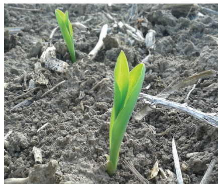
Drought tolerant crops are making an appearance in the US.

This year Monsanto will continue to focus on the western Plains states, and is expanding commercialization further east to involve about 200 farmers in Missouri, southern Iowa, southern Illinois, Kentucky and southern Indiana. MON87460 hybrids in 2013 were approved for import in China, a key export market. MON87460 is available as a stacked trait with insect resistance and herbicide tolerance. Monsanto has an ongoing collaboration with Ludwigshafen, Germany-based BASF to develop additional pathways to confer stress tolerance in corn and other crops. "The next generation is still very early in our pipeline," says Fietsam.